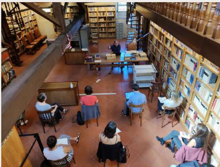
Doctoral workshop, Introduction aux sources du droit romain , 2020