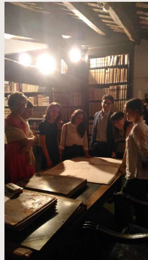
Doctoral workshop, Épigraphie , 2016